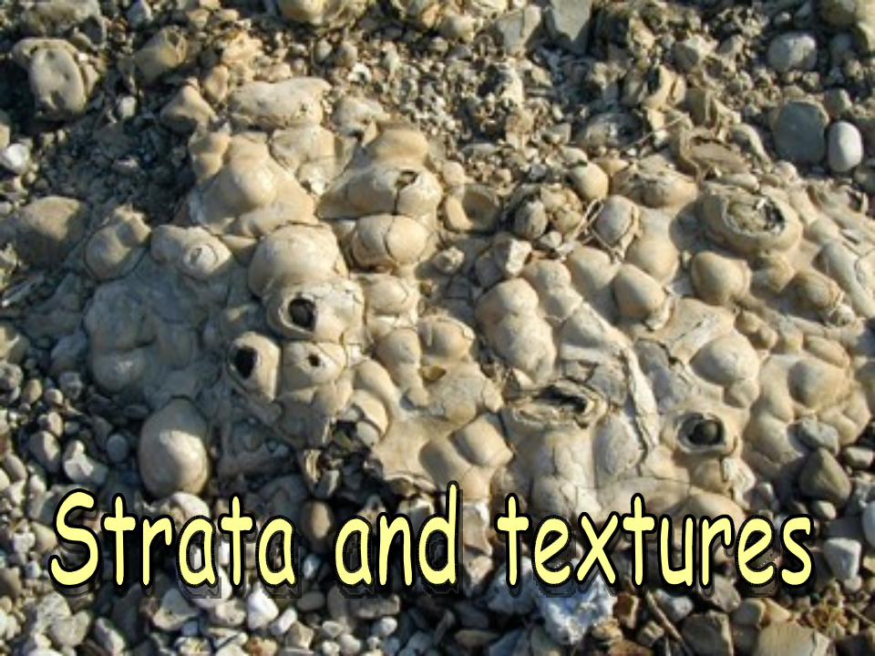
Strata and textures